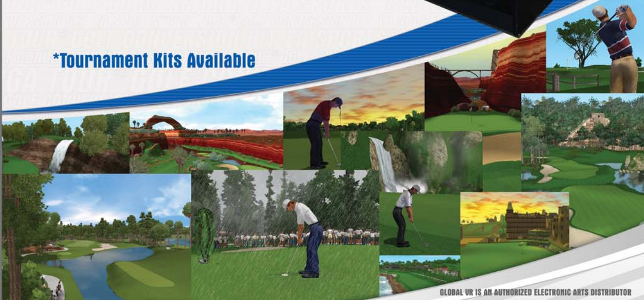
GLOBAL VR IS AN AUTHORIZED ELECTRONIC ARTS DISTRIBUTOR

For more information contact your local GLOBAL VR distributor or visit www.globalvr.com